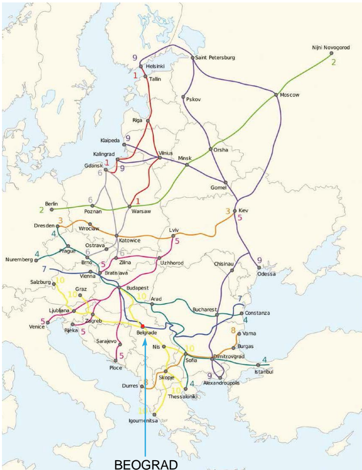
Pan-European Transport Corridors

Travel agency RECREATOURS are located in downtown Belgrade, the business, commercial and administrative part of the town. RECREATOURS have offices in several cities in Serbia, in Belgrade, Novi Sad, Nis, Valjevo, Jagodina and Trstenik. Also, RECREATOURS covered by a commercial service in the field on the Serbian and Montenegrin market.