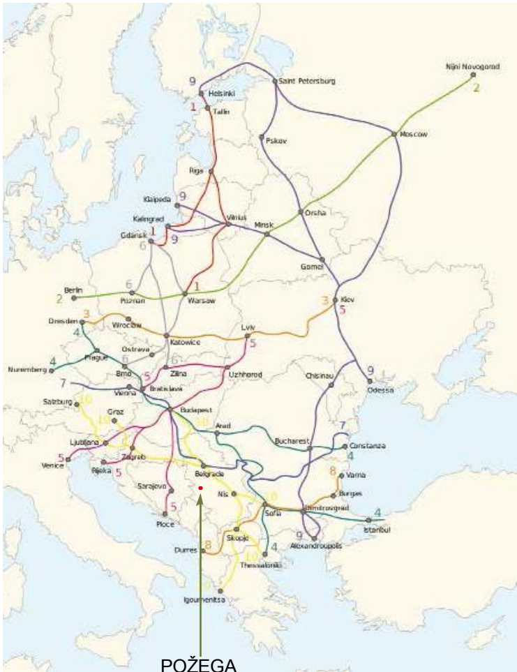
Pan-European Transport Corridors

Požega is situated on the main road and railway direction that connects Serbia, Montenegro and the whole region. The Company is located in Požega, in west parts of Republic of Serbia. Belgrade is some 165 km away and larger cities Beograd Užice, Čačak, Šabac, Loznica, Valjevo i Kraljevo are nearby, in radius of 100 km or less.